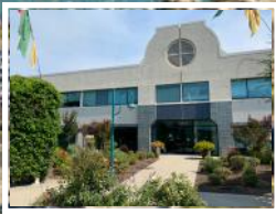
1003 W Cutting Blvd